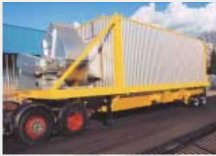
Mobile Bag Filter Unit