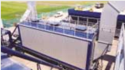
Mobile Bag Filter unit with free standing exhaust stack

Designed using the True Clean reverse air system, which eliminates the need for a separate compressor for cleaning down the bags. Efficient cleaning is achieved by an indexing distributor which induces a reverse flow of atmospheric air through the bags. The air causes the bags to expand and release any collected dust which falls to a bottom hopper. This method is efficient and offers extended bag life with low maintenance and noise levels.