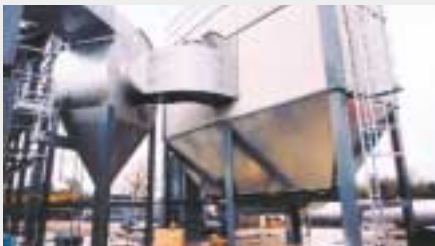
Primary Inertial Skimmer and Bag Filter

Dust Conditioner Designed to wet condition the collected dust from the bag filter and convert it into a form suitable for open lorry loading. Twin contra-rotating shafts with angled blades to ensure a thorough mixing of dust and water.